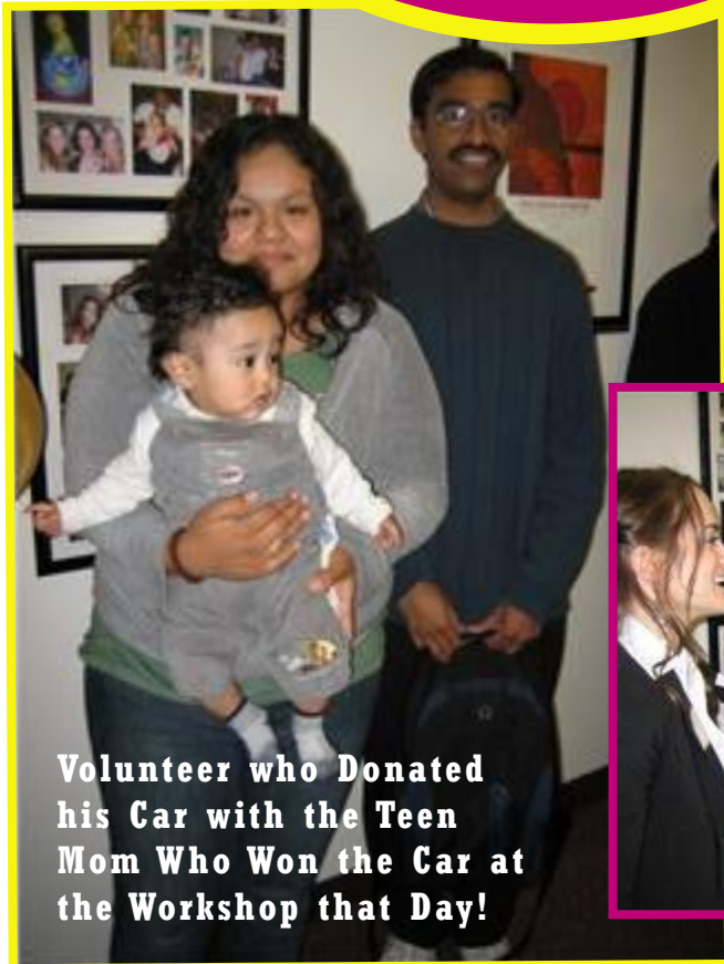
Volunteer who Donated his Car with the Teen Mom Who Won the Car at the Workshop that Day!