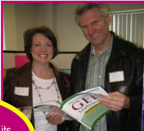
Friends of alley's house

Saturday, April 14 alley's house opened its doors to friends and supporters to see the new office!