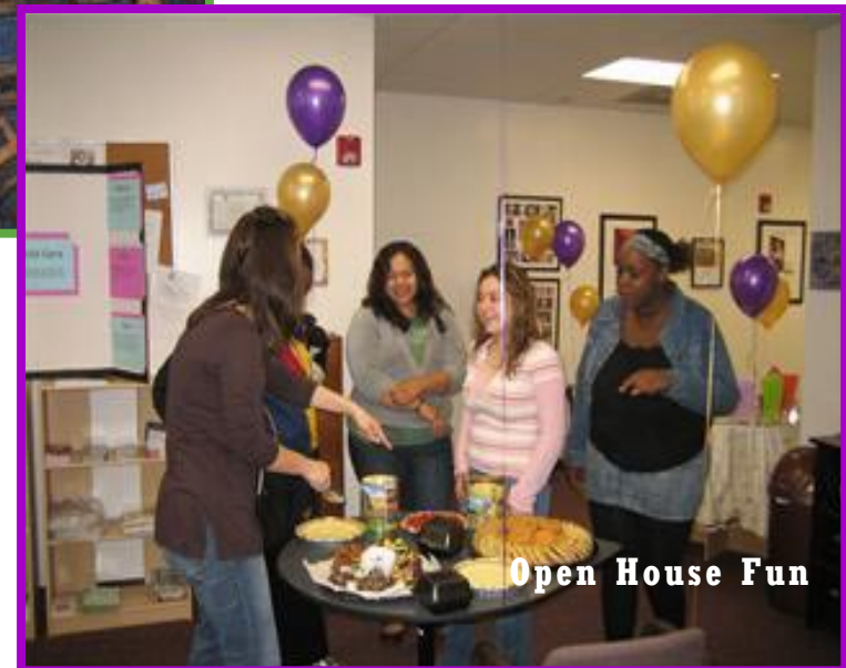
Open House Fun