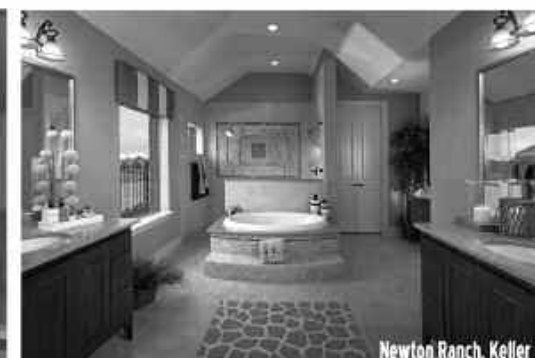
Newton Ranch, Keller

Award-Winning Designs | $190s to $730s | 7 New Models to Explore | 30 Locations throughout the Metroplex