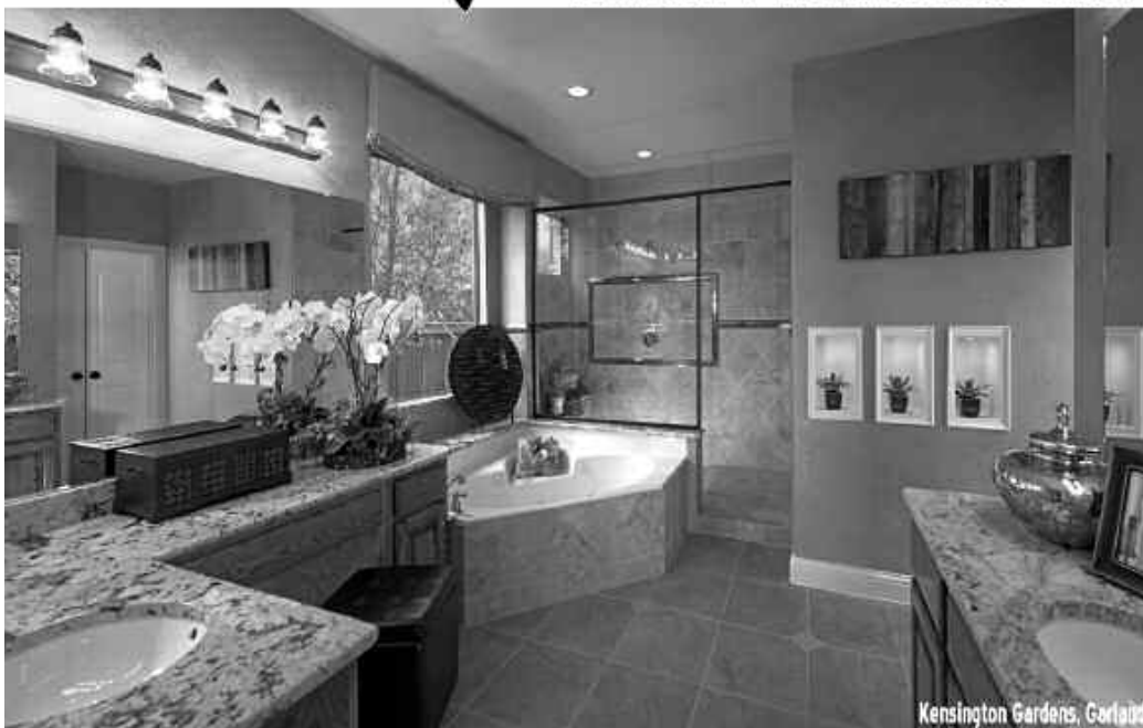
Kensington Gardens, Garland