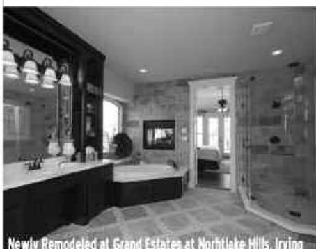
Newly Remodeled at Grand Estates at Northlake Hills, Irving